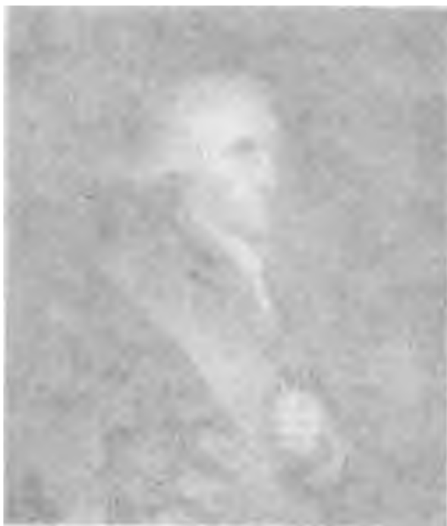
George Brydges Rodney, Lord Rodney.